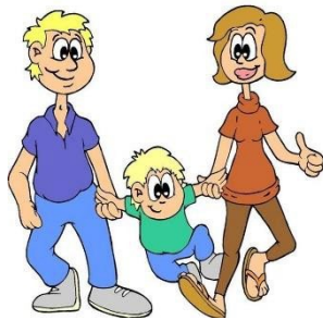
Stay near my family