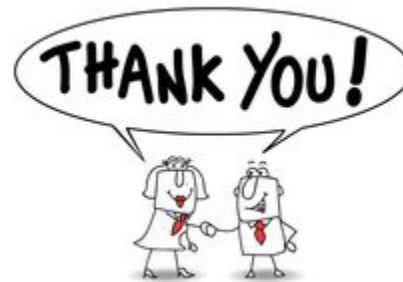
Be polite to others